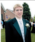
We're looking forward to more roadtrips to swim meets. Have fun (but not too much!) at FSU! Love, Mom & Dad