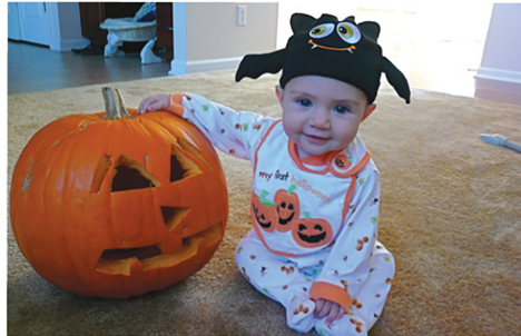
You will always be our little girl! Love, Mom & Dad