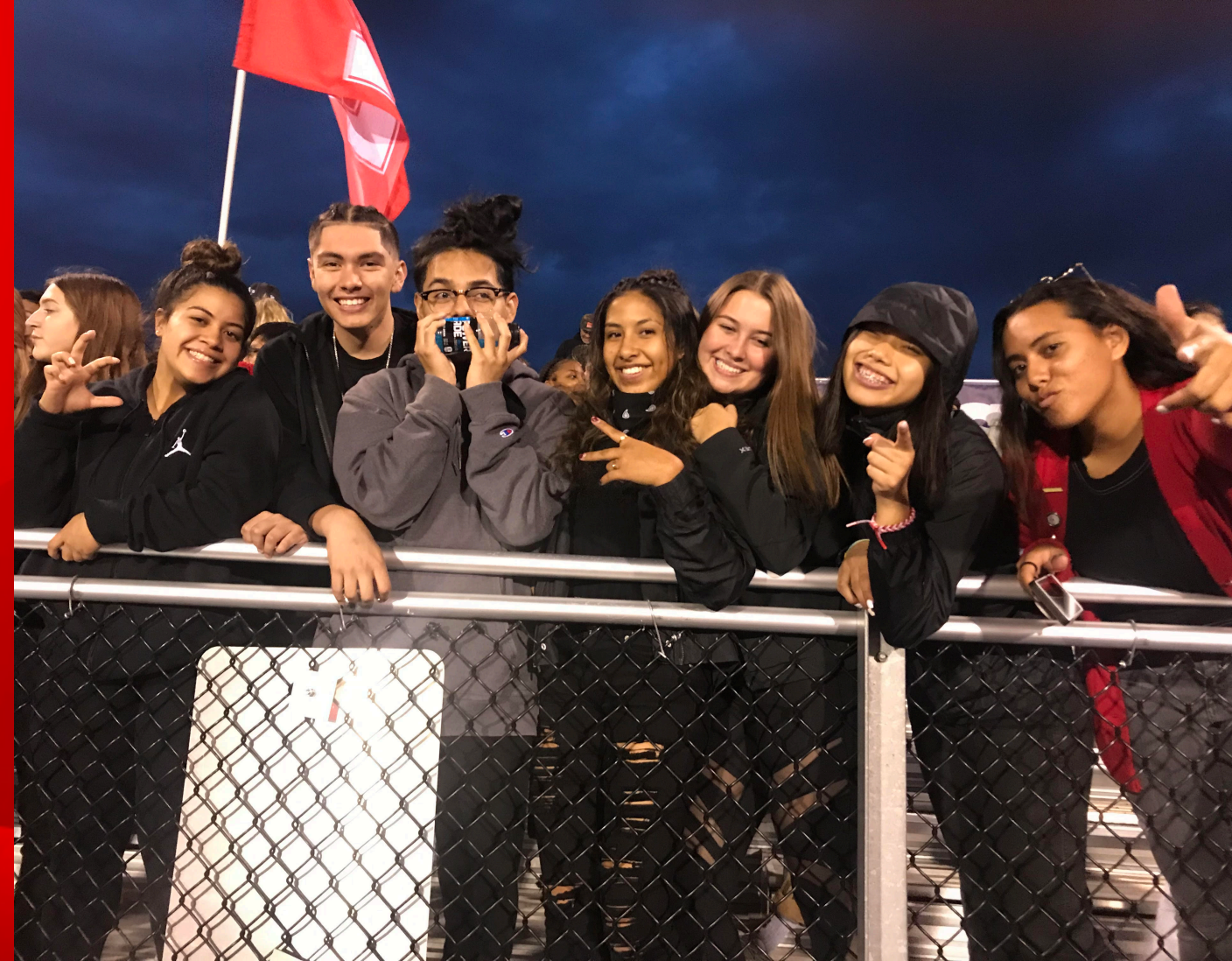
2019-20 EHS Student Government